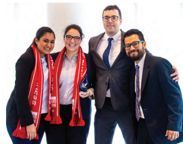
BC MBA Games Case Winners

Graduate Women's Council strives to empower women to lead and succeed in the workplace. This active student leadership team provides networking opportunities, workshops, and access to external events aimed at developing and sustaining a culture of support and encouragement.